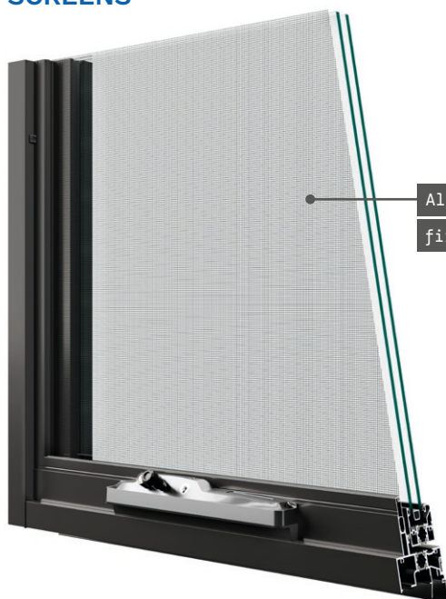
Aluminium screen fixed internally.