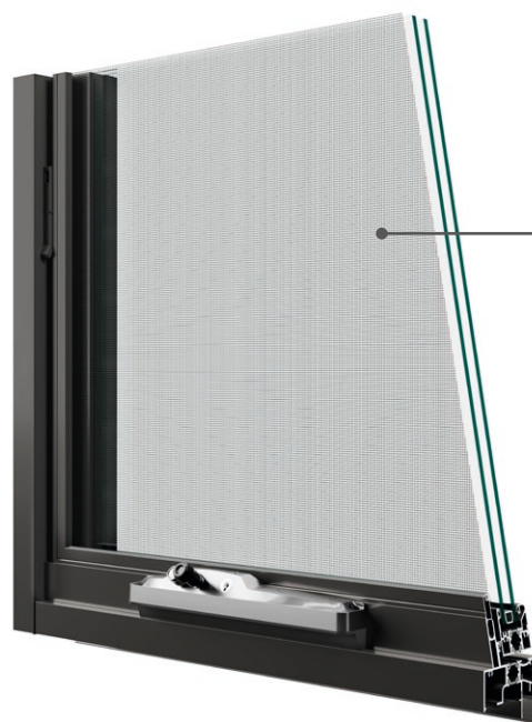
Aluminium screen fixed internally, with cam catches.

Whilst the utmost care is taken to ensure the accuracy of the information contained herein, it is provided in the understanding that the company shall under no circumstances be liable for any injuries, expenses or other losses which may in any way be attributable to the use or adoption of such data and/or design details. Stegbar reserves the right to alter or amend without prior notice data and design details specified herein. stegbar.com.au JWSNAT0600/0723